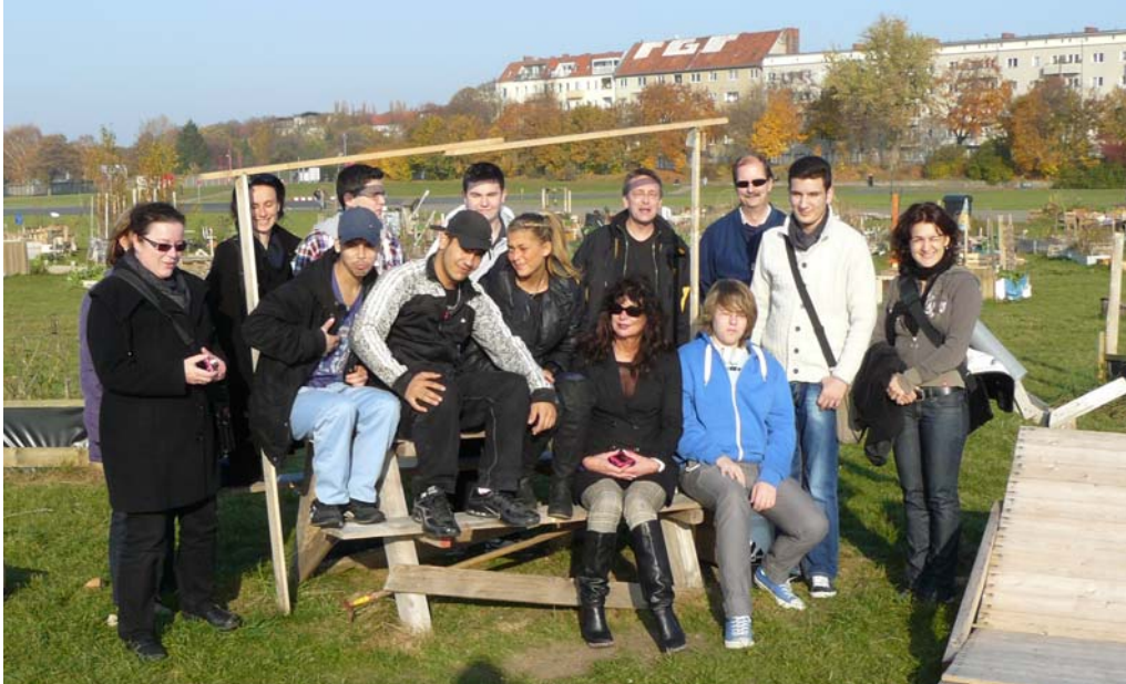
Visit with the students from the Carl-Legien-School at the Tempelhofer Feld

The participants got some handouts of the theoretical inputs and of the practical exercises. The workshop-group prepares at the end of the day a wallpaper for the presentation of their results. In a feedback-round the participants recommended that they got new ideas concerning the topic and that they will test some of the methods in their educational work with their students.